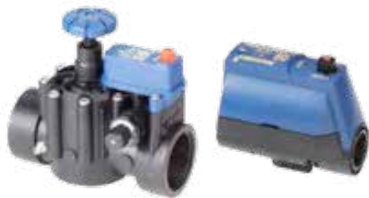
1 1/2" - 2" MODEL